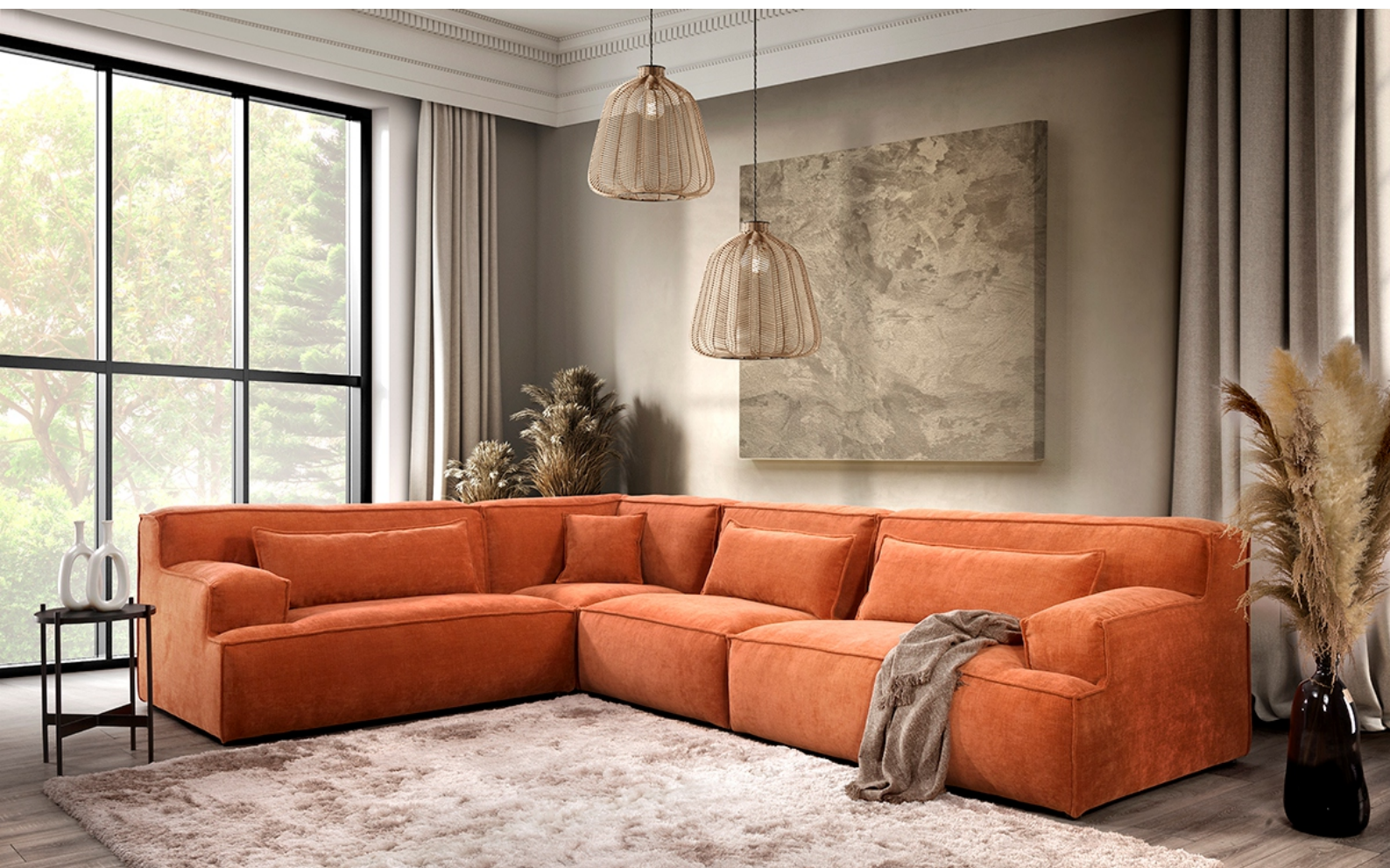
Lecco 1,5 MAX PL – C – 1,5 AL. – 1,5 MAX PR Fabric: Terranova 16