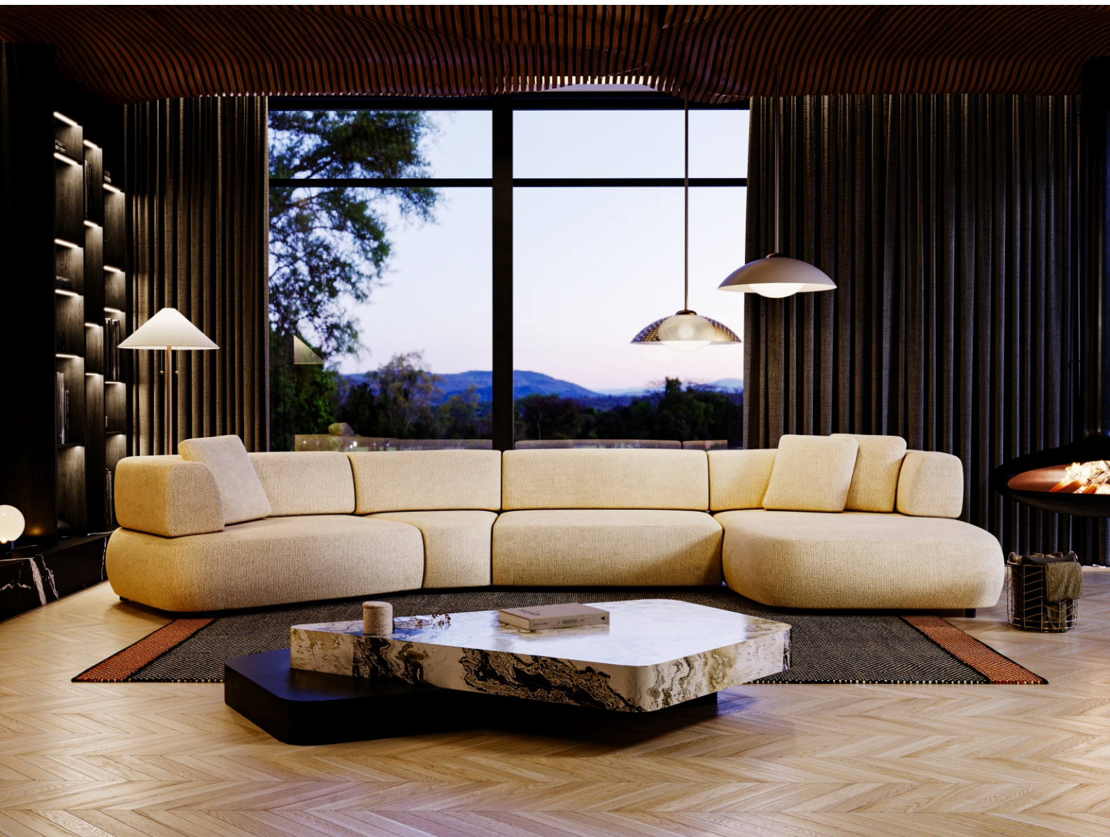
Eder 1,5MAX PL-E-1,5MAX AL-DMAX R